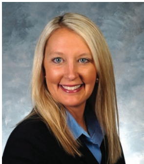
Senator Julie Raque Adams