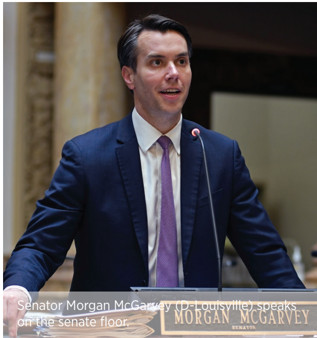
Senator Morgan McGarvey (D-Louisville) speaks on the senate floor.

House Bill 218 (T. Huff) reduced the waiting period and fees for felony expungement and Senate Bill 33 (J. Higdon) clarified expungement waiting periods for enhanceable misdemeanor offenses, i.e., penalties and waiting periods that are increased for a subsequent offense. These bills were critical workforce bills that could increase opportunities for individuals with felony records to access gainful employment and reduce recidivism.