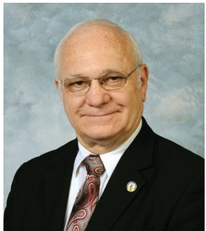
Senator Mike Nemes