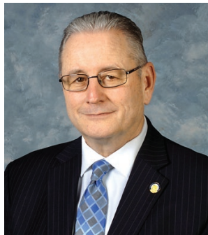
Senator Jimmy Higdon