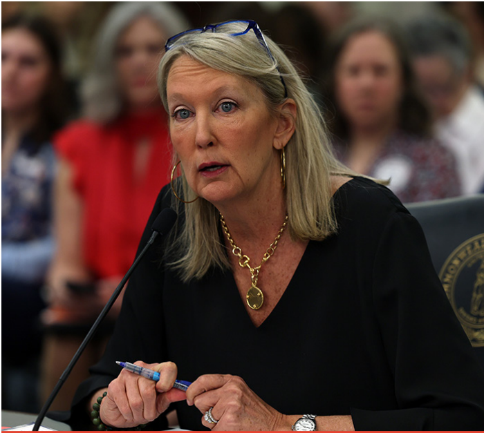
Sen. Julie Raque Adams, R-Louisville, testifying on Senate Bill 129 in committee.