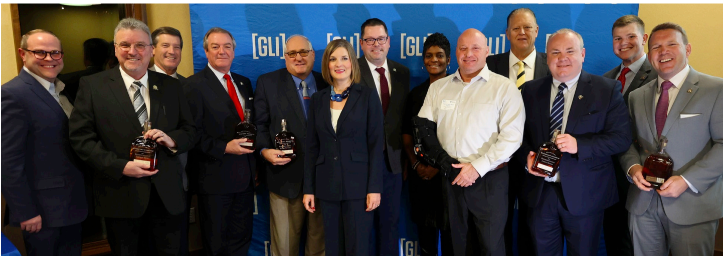
GLI's Most Valuable Policymakers of the 2024 session after their recognition.