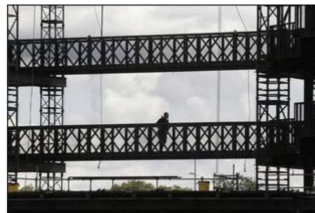
+ enlarge A worker was silhouetted on the main stage as workers prepared for the Rolling Stones concert at Churchill Downs.

So besides the races, that means more weddings, receptions and conference events --